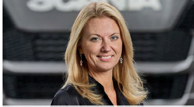
Scania